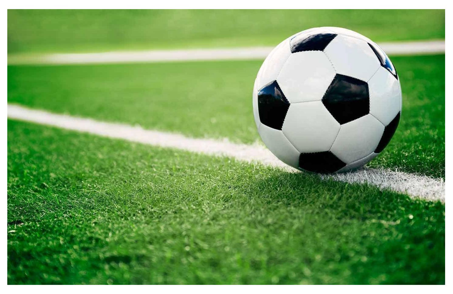
"SPORTSMANSHIP IS EVERYONE'S RESPONSIBILITY! BE A GOOD SPORT!"

Achieving gender equity through a continuous commitment to girls' and women's sports.