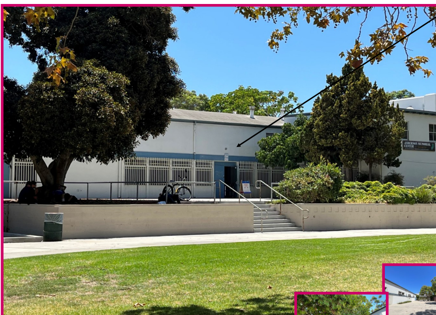
Entrance-north side of the building on 8th Street