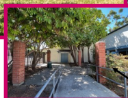
Courtyard on 9th Street