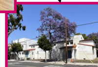
West side of the Building on Mesa Street