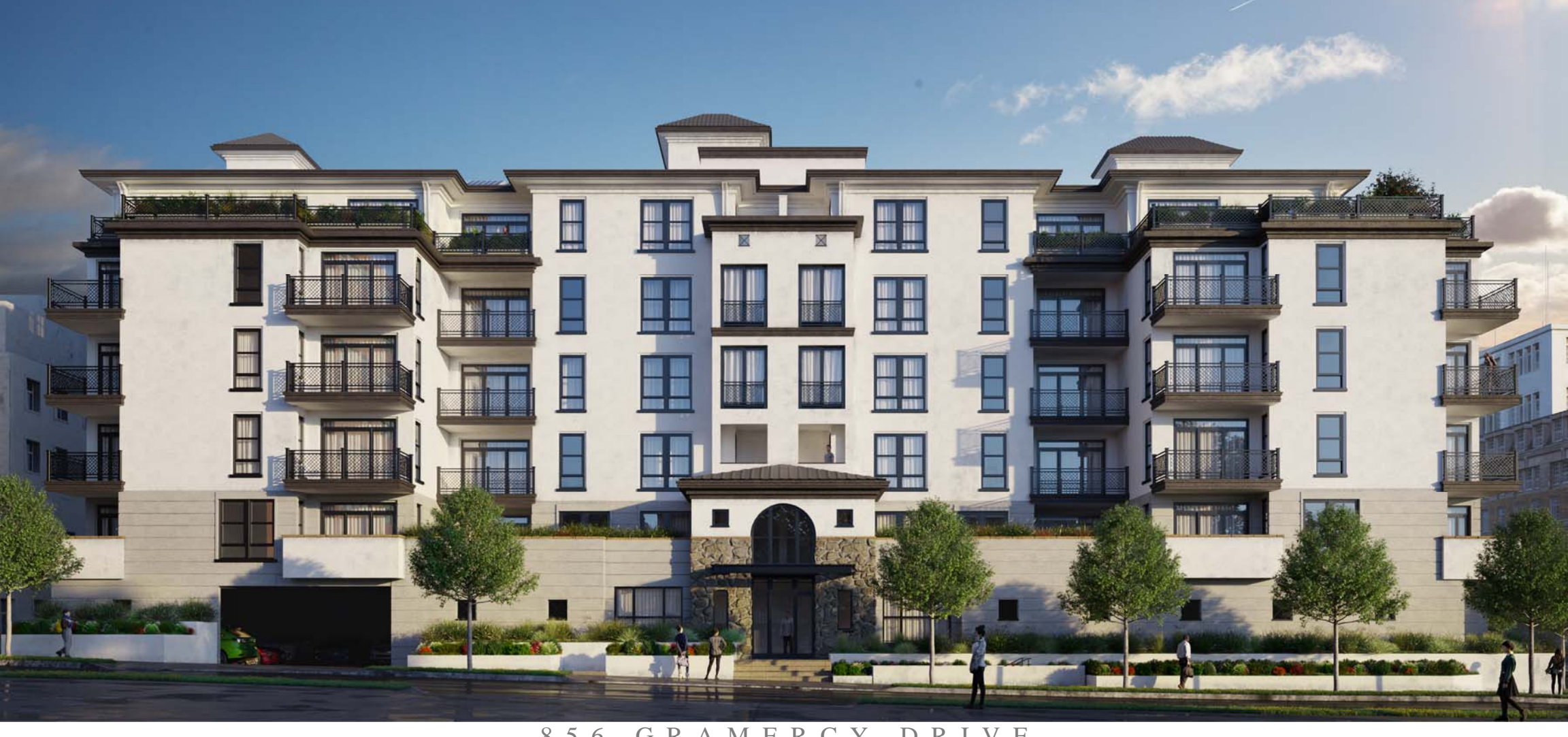
8 5 6 GRAMERCY DRIVE