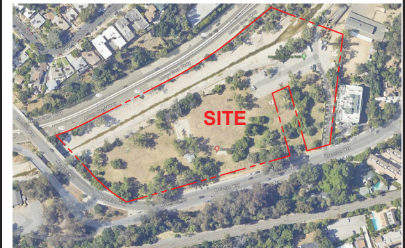
SITE MAP NOT TO SCALE

PROJECT NAME: AVENUE 64 PARK ADDRESS: 6742 Marrimon Way, South Pasadena, CA 91030