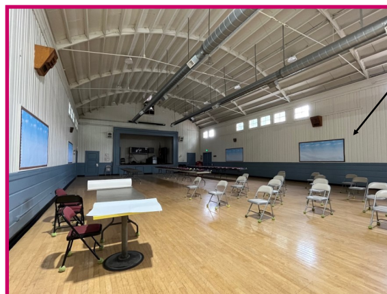
Auditorium on Mesa Street