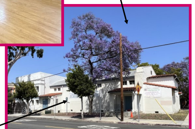
West side of the Building on Mesa Street