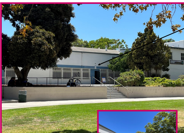
Entrance-north side of the building on 8th Street