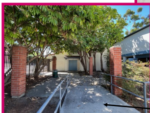
Courtyard on 9th Street