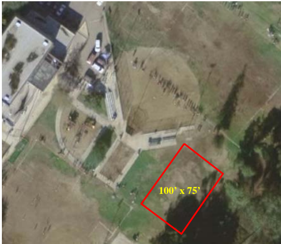
Glassell Park Nike Synthetic Soccer Field Location and Dimensions