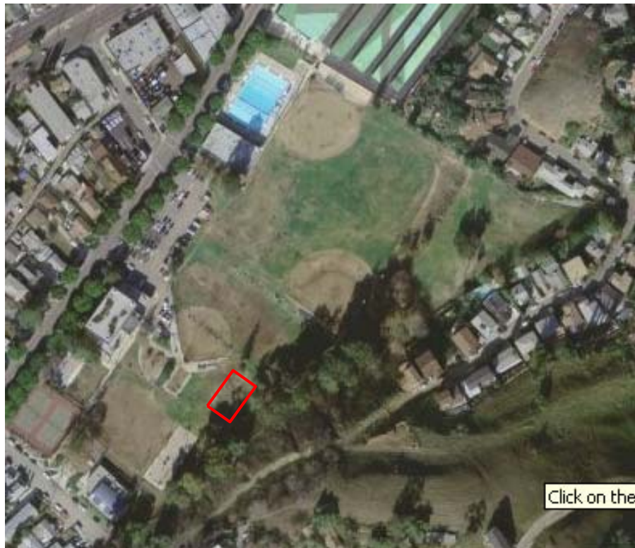
EXHIBIT – B