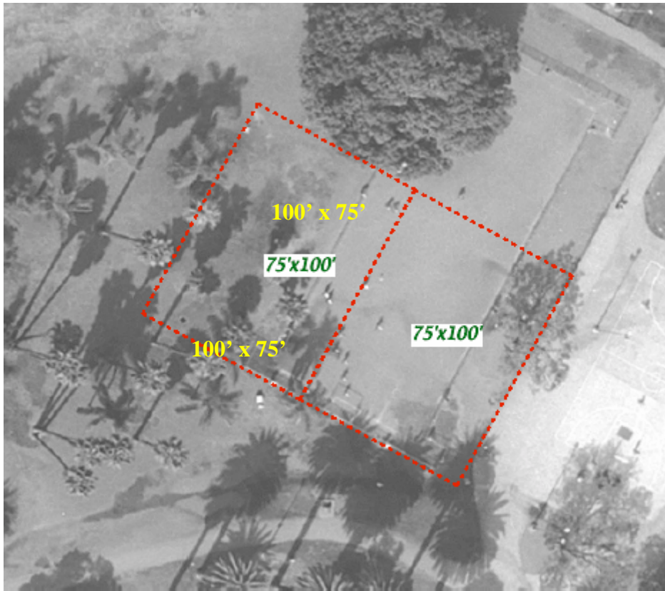
Lafayette Park Nike Synthetic Soccer Field Location and Dimensions