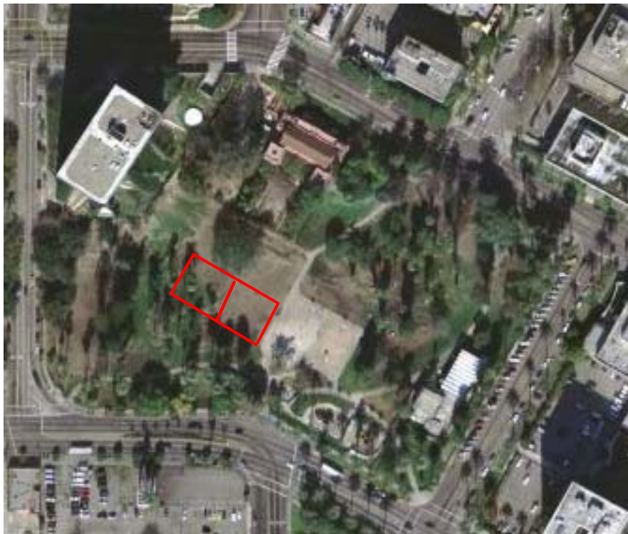
EXHIBIT - A