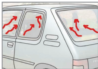
2. These heated objects then heat the trapped air inside of the car, similarly to that of a convection oven.