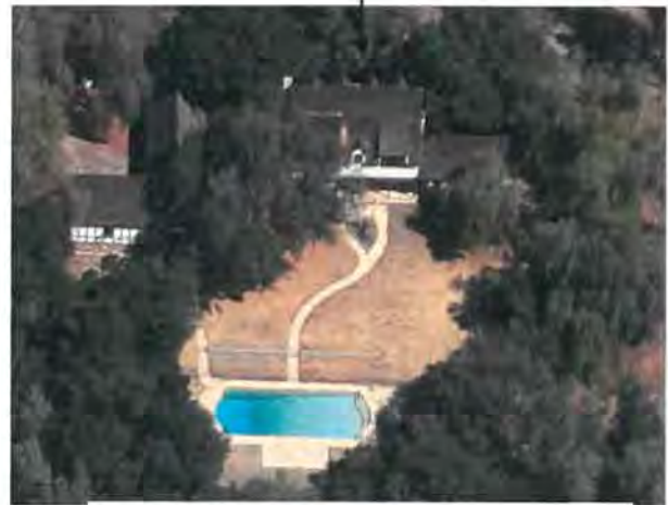
OAKRIDGE Residential Structure and surrounding grounds.

18650 Devonshire St, Northridge, CA 91324